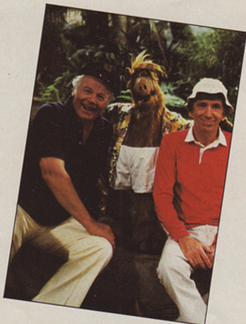
(Above) America's favorite alien meets America's most famous castaways: the Skipper (left) and Gilligan. Reruns of their show, Gilligan's Island, are Alf's favorite. (Below) A long way from home, the Alfer blows a mean and mournful sax.

Alf: Brian's great! He's my TV-watching buddy. He's about the only human I've met who likes Cheese Doodles as much as me. And Lynn's beautiful! I wish I'd